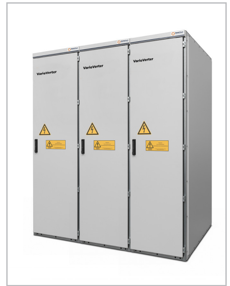
VarioVerter Cyclo Power Section