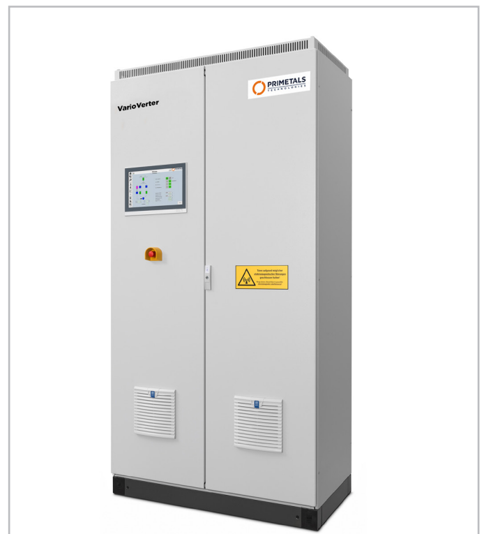
VarioVerter Cyclo Control Cabinet

existing motors and transformers to remain in place, and slashing investment costs as a result. And because only the cycloconverter itself is swapped out, the overall footprint of the existing drive system remains unchanged.