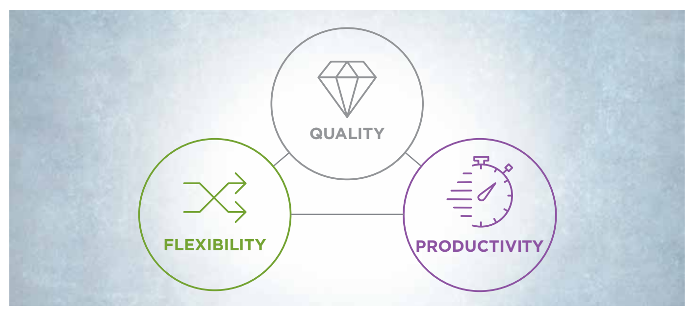
Today's metals producers are aiming to further improve their end-product quality, their plant's flexibility, and overall productivity.