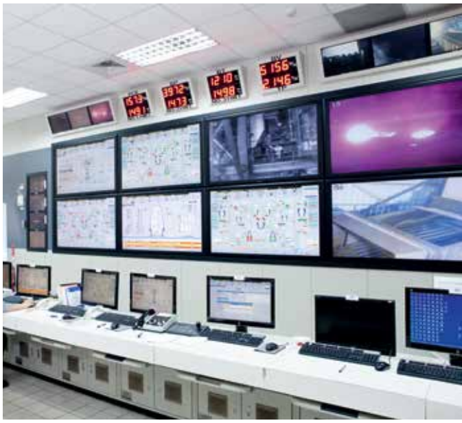
Each facility along the metals production chain has to fulfill certain requirements to optimally interact with one another for optimal results. Primetals Technologies has developed the solutions to turn your plant into a world-class "Metals Orchestra."