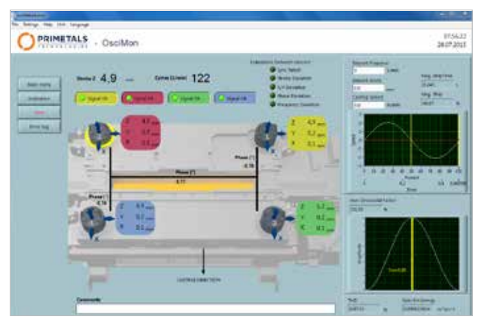
OsciMon Main screen slab

Additional metallurgical parameters (e.g. non sinusoidal factor, negative strip time, phase shift) can be calculated.