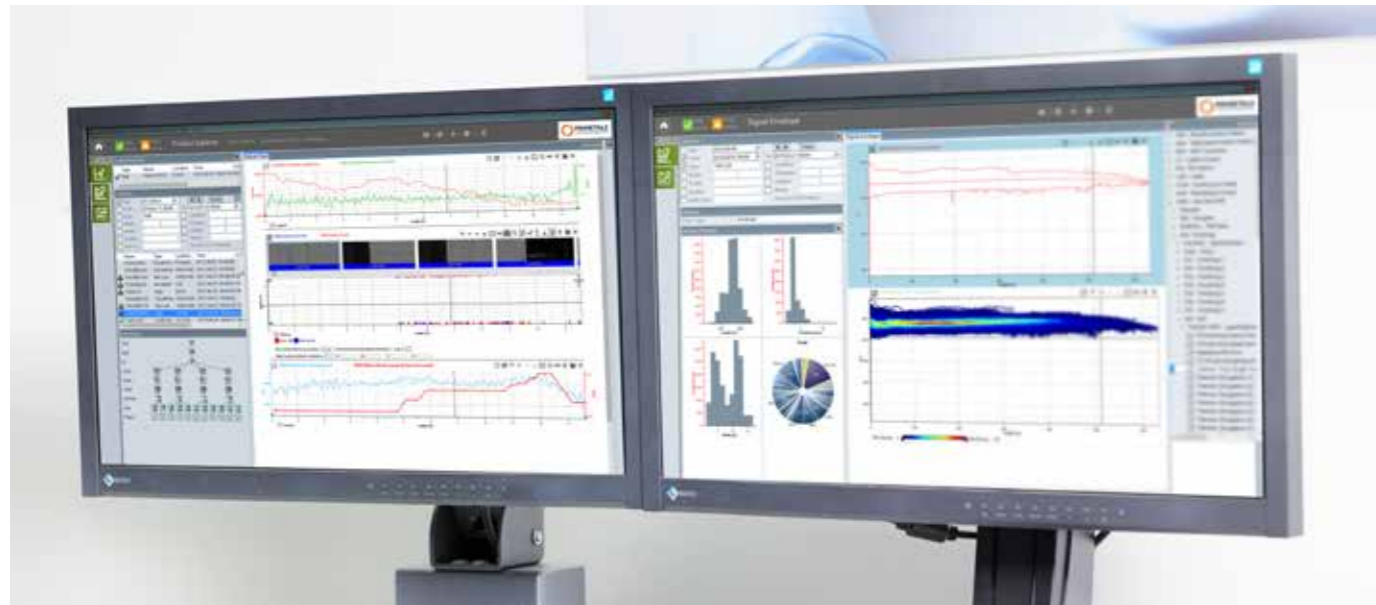
TPQC - clients

Through-Process Quality Control is a quality system intended to cover the entire production line from the liquid phase to the finishing and packaging lines of the final end product. For this reason the term Through-Process has been coined to emphasize this idea.