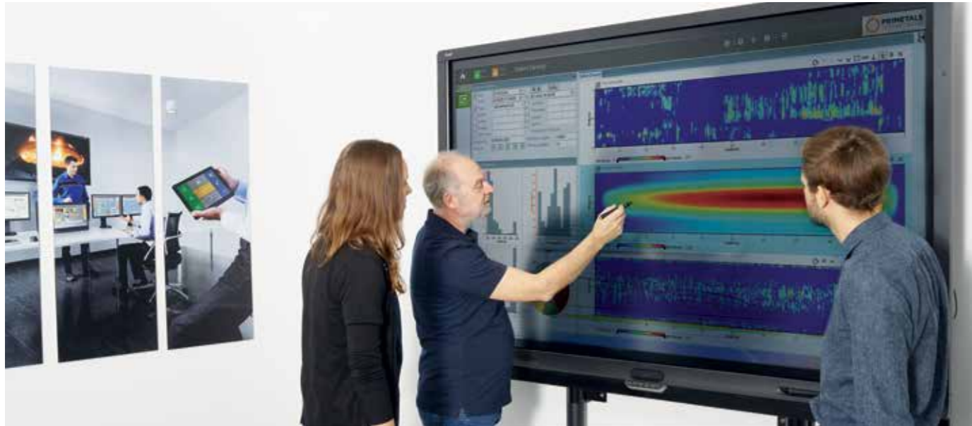
Expert consulting supported by TPQC

Primetals Technologies has developed a portfolio of consulting services and trainings executed by experts to improve the capability of analyzing, operating and improving process units and quality of products along the whole production chain. Consulting and trainings are conducted by a selected pool of experts with long term experience from working at international leading steel producers.