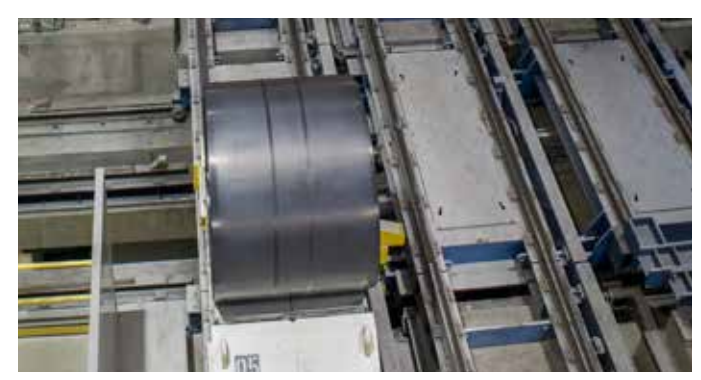
Removal of cars from the main transport line

The shifting station is used to remove a Modular Coil Shuttle car from the main track for coil inspection or maintenance, or to return an MCS car after coil inspection or maintenance to the main track. Up to three segments are shifted simultaneously (as one station) so that the main track is not interrupted after a car has been removed.