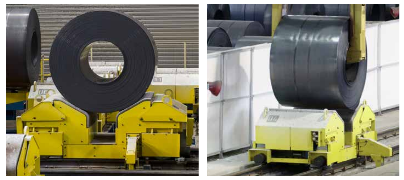
Modular Coil Shuttle car on a turntable