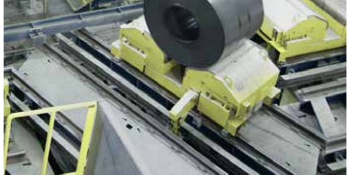
Lateral movement of the coil cars

The movable station is used to shift the loaded or unloaded Modular Coil Shuttle cars perpendicular to the main transport direction of the MCS car in order to facilitate lateral movements if the transfer route is changed. A movable station is, therefore, typically placed at the end of the transport system to ensure that the loop is closed.