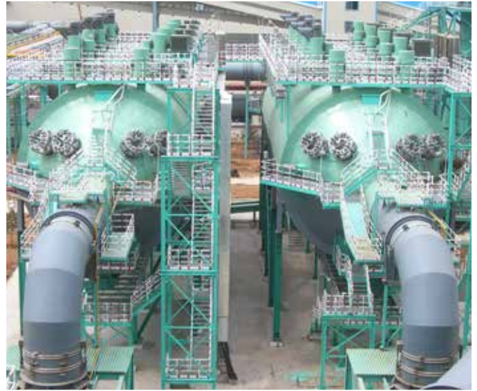
Electrostatic precipitator (ESP)