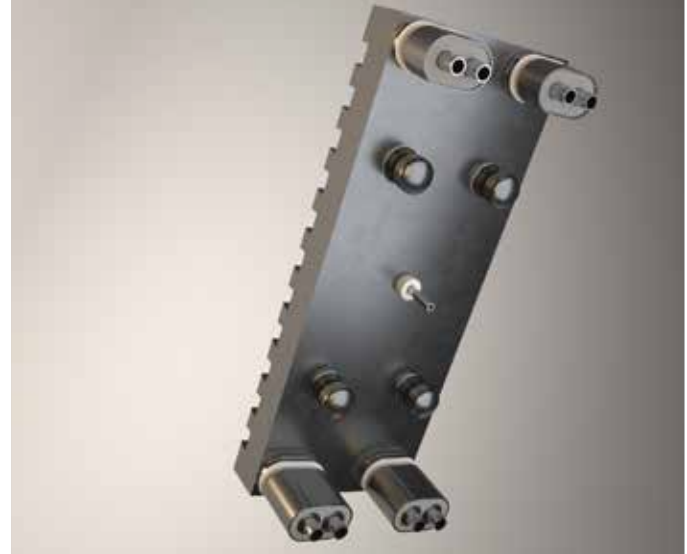
Computer animated images of a cast-iron stave from Primetals Technologies