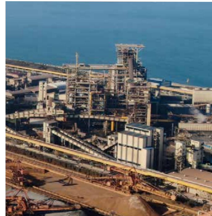
FINEX 2.0 M Plant, POSCO