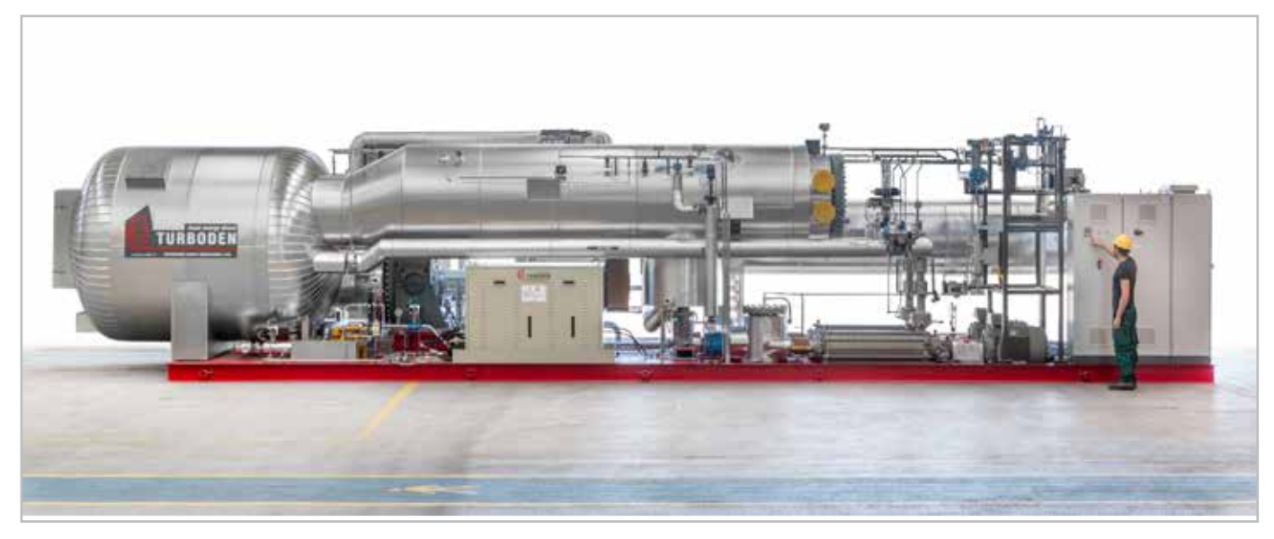
700 MW Turboden ORC plant at Turboden factory, Flero (Brescia), Italy - 2016