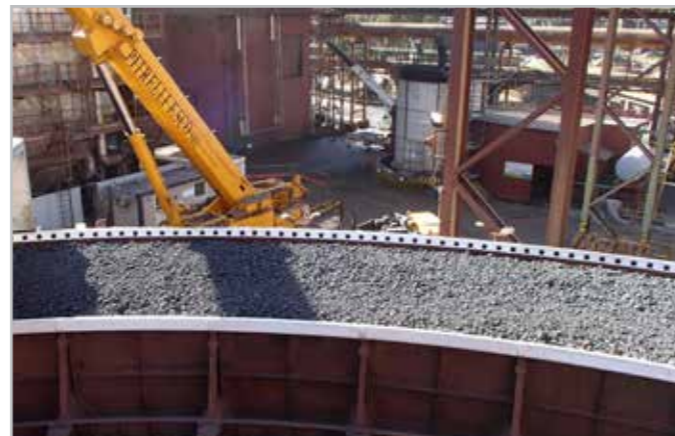
The patented design of the cooler charging chute leads to an optimized segregation of the sinter particles across the sinter bed after modernization.