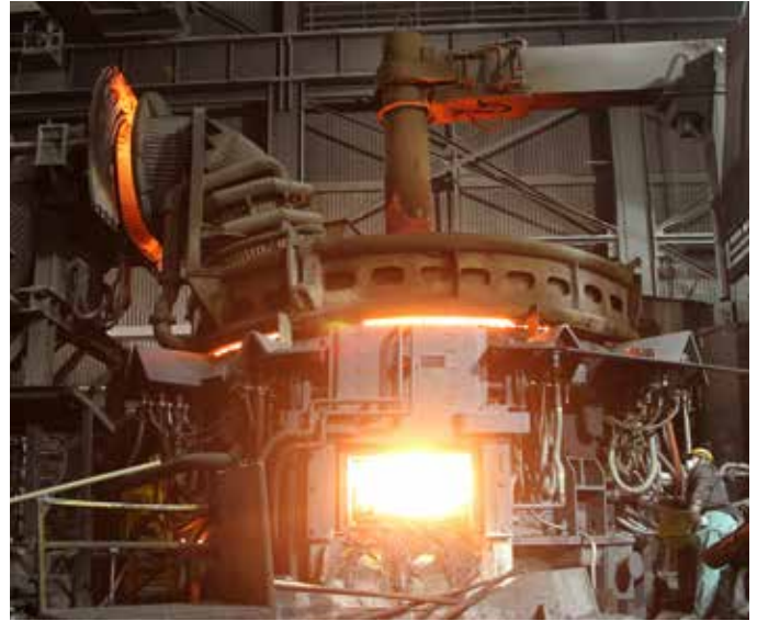
Anode lifetime of more than 2,000 heats