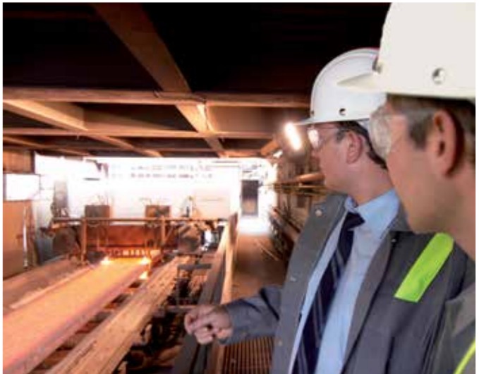
Second step: on-site inspection