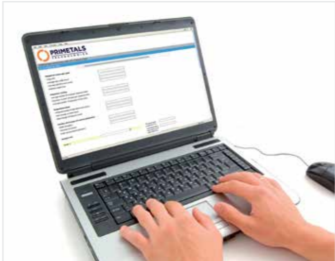
First step: questionnaire