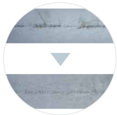
Slab quality improvement

Caster Technology Consulting from Primetals Technologies stands for expertise in quality improvement, numerical simulation and special component design. In order to provide the ideal solution to meet the specific requirements of each producer, we can call on our disposal caster experts and access our comprehensive metallurgical and operational database. By taking even small steps towards a solution, you can achieve dramatic improvements in cost-effective and reliable production.