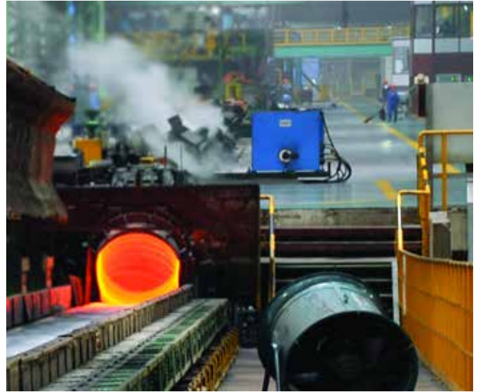
Orbis+ gauge in the off line position