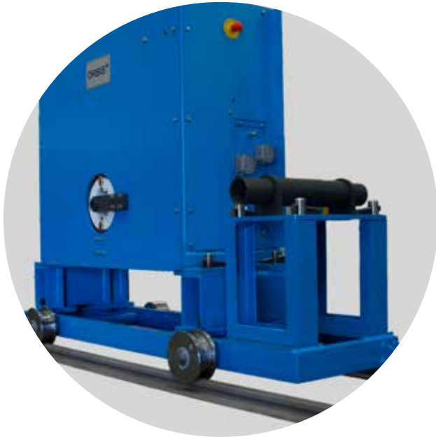
Orbis+ - Profile Perfection