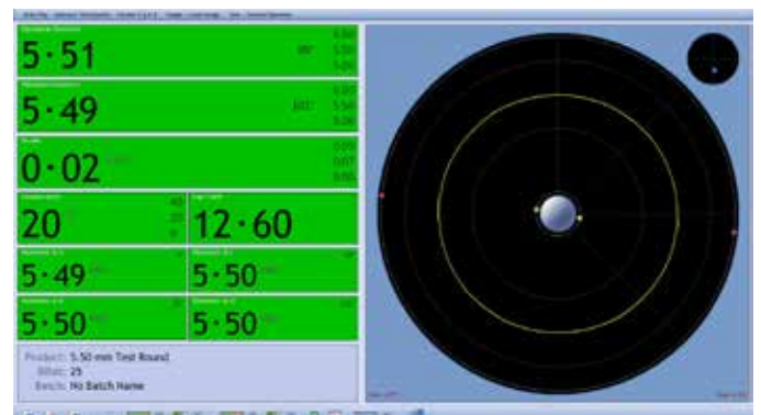
Orbis+ User display interface

The Orbis+ has 200 references installed over a period of 20 years.