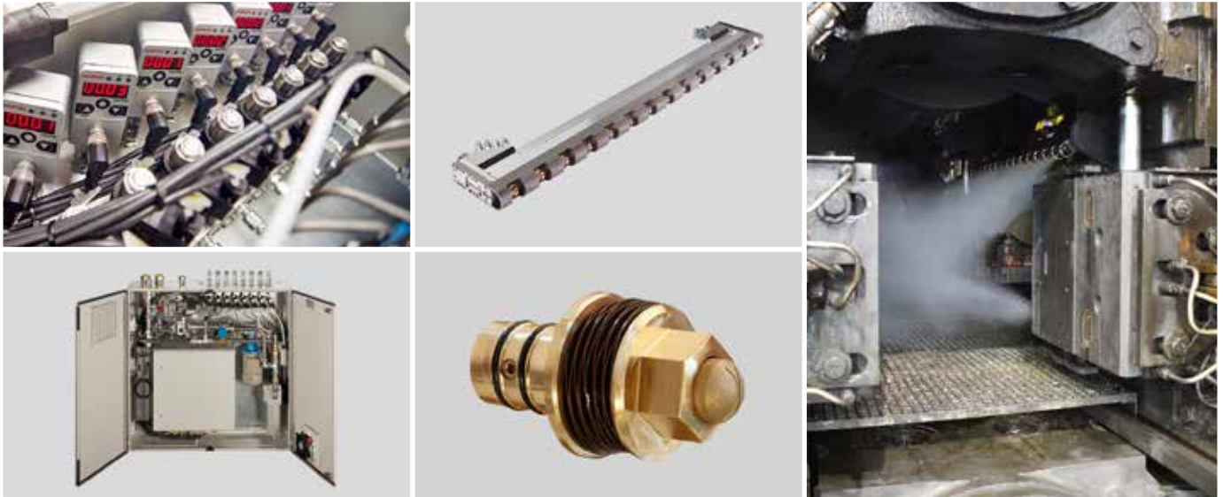
Minimum Quantity Lubrication MQL® equipment overview and spray test

the oil mist on the entry side is prevented. The coefficients of friction between the work roll and the strip can be decreased compared to other lubrication methods.