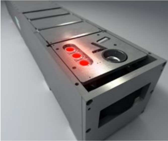
Independent carriages incorporating precise strip edge tracking