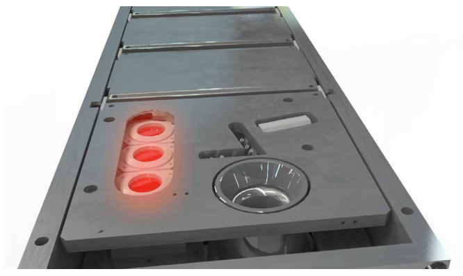
Dedicated edge wiping technology