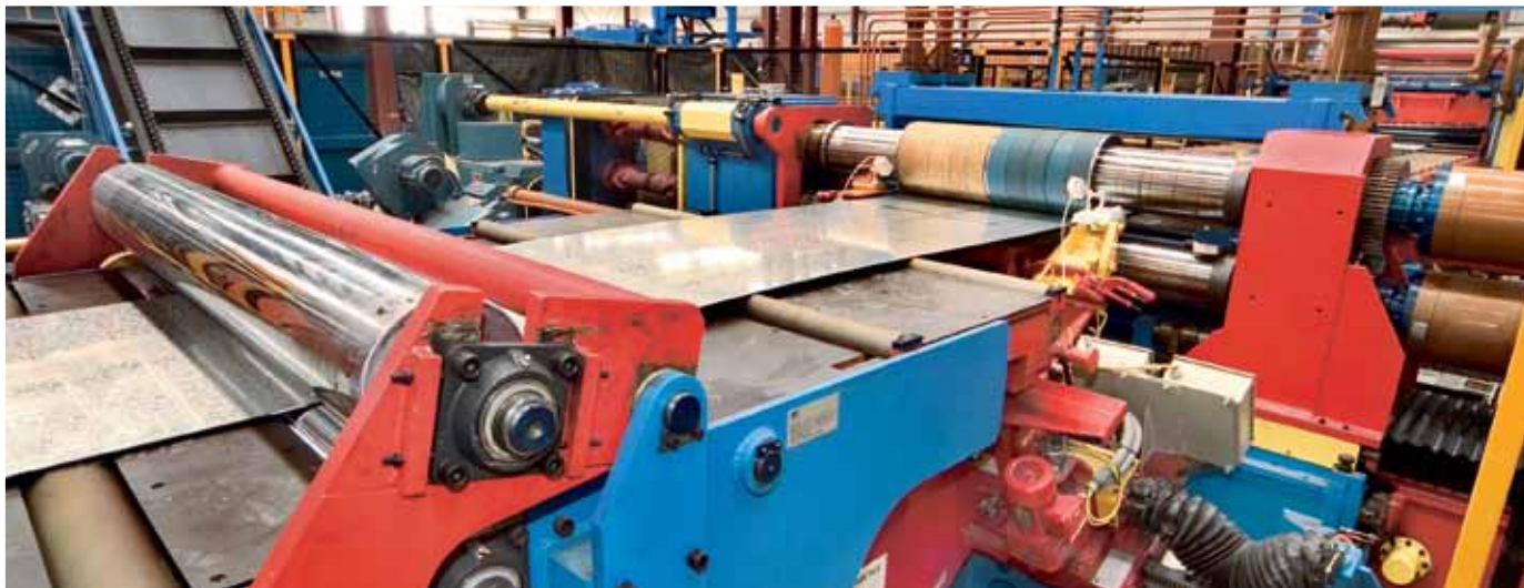
Slitting line at BlueScope Steel, Perth, Australia