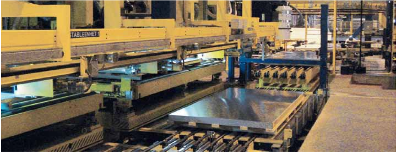
Cut-to-length line, Hydro Aluminium, Norway