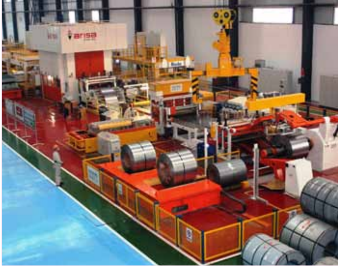
Blanking line, Baosteel Group, Zhengzhou, PR China

Our lines are designed to meet your needs from the most demanding automotive quality to the stiff and heavy-duty applications for heavy-gauge hot-rolled strip.