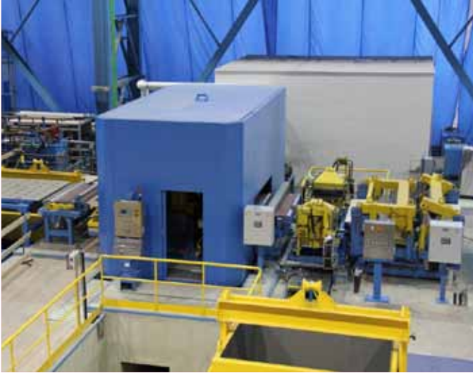
Welder Recoiling and Inspection Line, USS Kosice, Slovakia