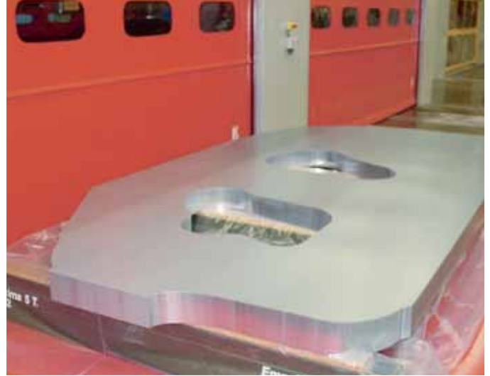
Blanking line at Gonvarri, Brazil