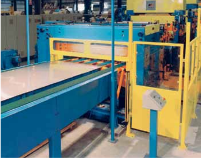
Cut-to-length line, Ugine Iberica S.A., Spain