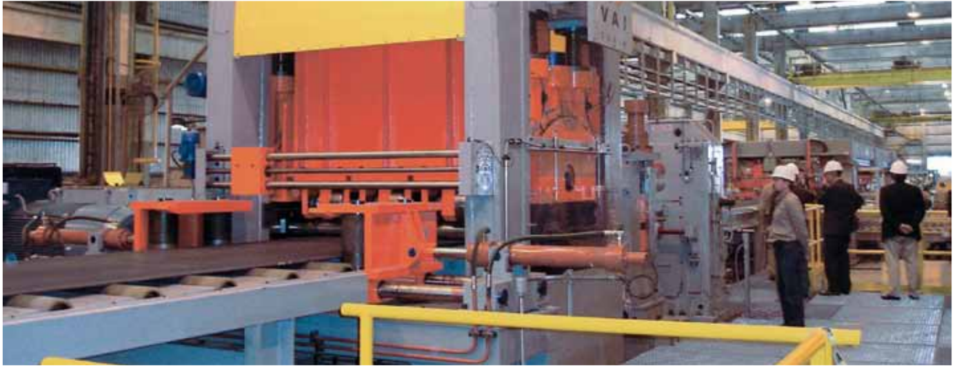
Cut-to-length line, Siderar, Argentina